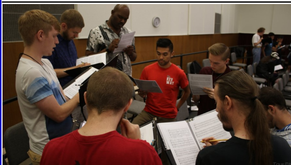
#CSUFUniversitySingers rehearsing Bach's motet, "Jesu, meine Freude"