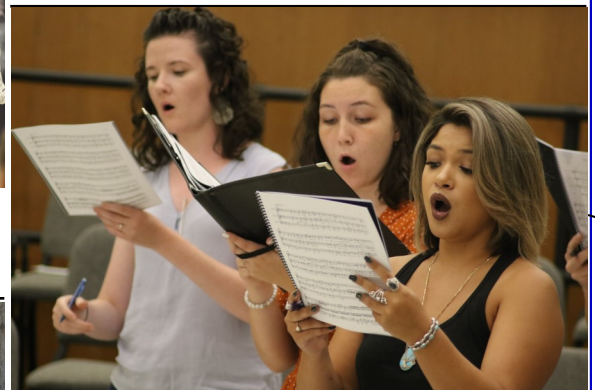
#CSUFUniversitySingers rehearsing Bach's motet, "Jesu, meine Freude"