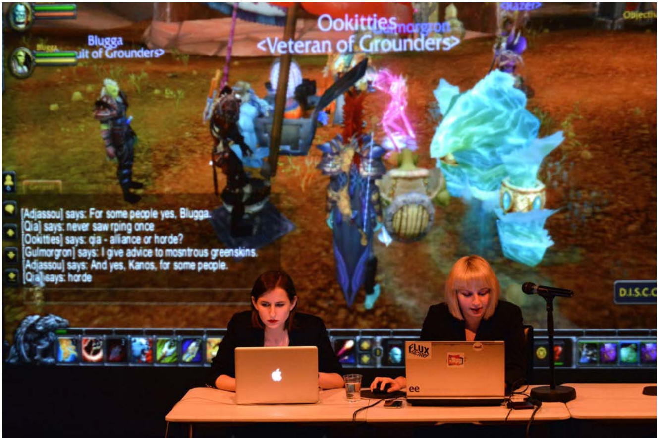
The Council on Gender Sensitivity and Behavioral Awareness in World of Warcraft: Live, 2015, Performance documentation still