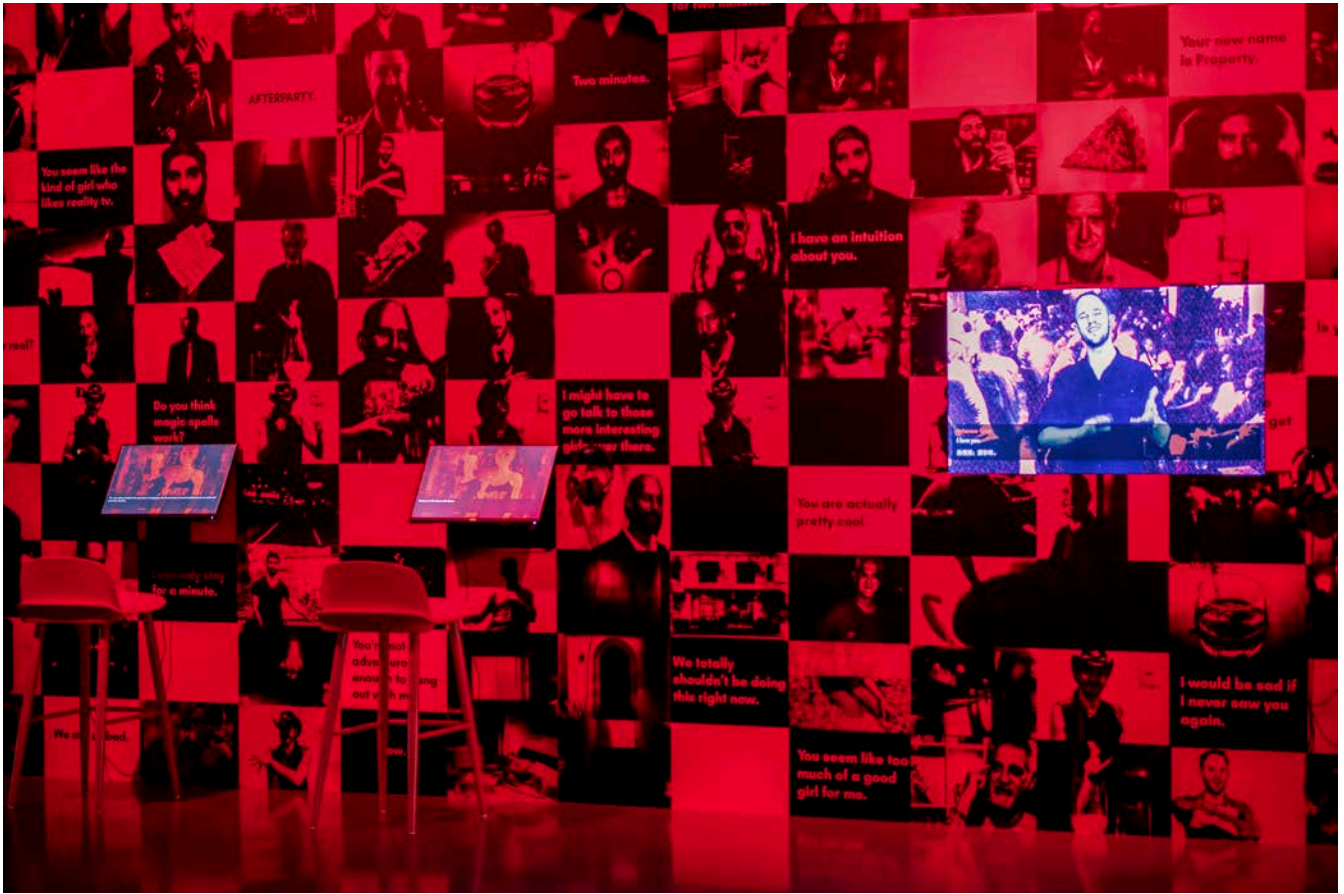
The Game: The Game, 2020, Media Installation at Hyundai Motor Studio, Beijing