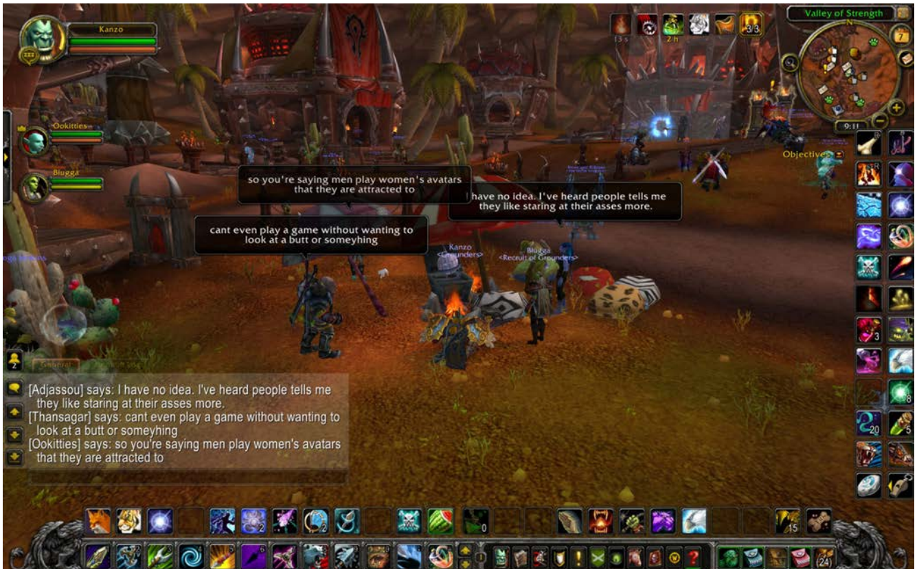
The Council on Gender Sensitivity and Behavioral Awareness in World of Warcraft, 2012-2016, Still from video