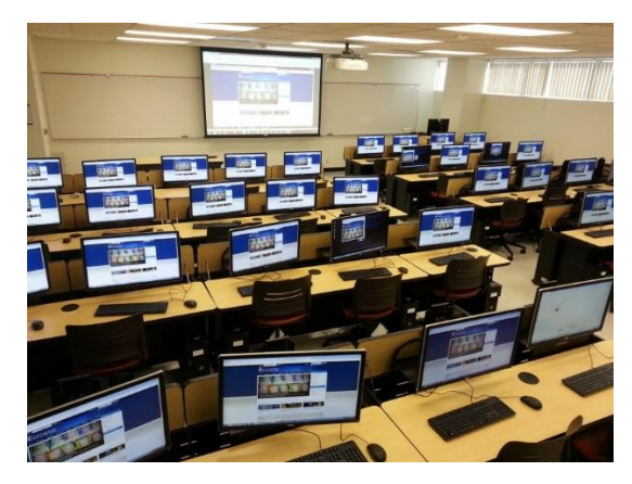
Figure VI-2 Computer Aided Design Classroom CS-309