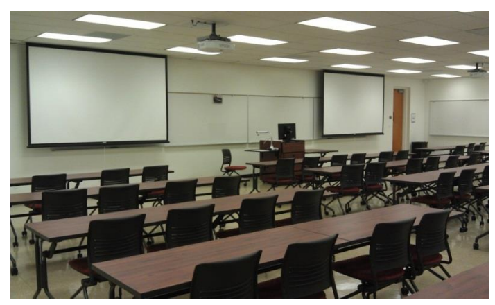
Figure VI-1. Smart Classroom E-201

The ME Department classrooms/laboratory facilities occupy 10 rooms, with a total of approximately 17,500 square feet of total space. Plus there are three smaller rooms equipped with computers and access to the Internet that are assigned as student project. Most classrooms used by the ME students have a capacity 30 to 70 students. There have been several classroom upgrades that include "Smart Classroom" features. This type of classroom features high tech multimedia equipment and instructional computer that include DVD player, multiple projectors, speakers and the Internet access. Instructors can communicate interactively with students through computers in near real time. Recent classroom renovations such as Room CS-304 (Smart Classroom with 48 Dell computer stations), Room E-201 (Figure VI-1, Smart Classroom with 40 Dell computer stations) are where many of mechanical engineering courses are held.