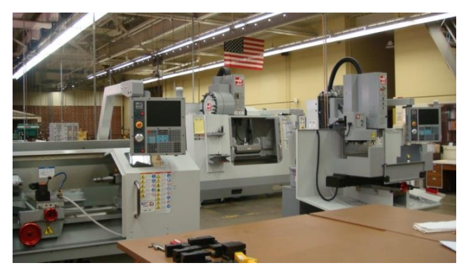
Figure VI-4 Haas TL-1 Conventional/CNC Lathe