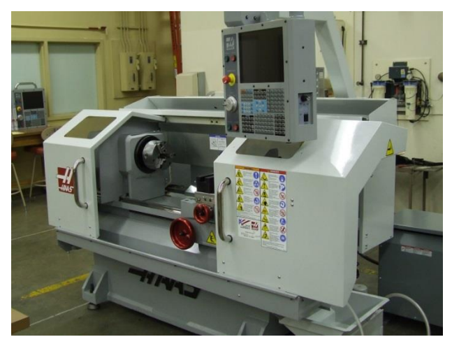
Figure VI-3 Haas TL-1 Conventional/CNC Lathe