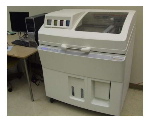
Figure VI-5 System Rapid Prototyping Machine

With the mechanical engineering student enrollment tripling in the last five years (both undergraduate and graduate students), a need for more computer rooms and project spaces are becoming vital . Currently, the available research space for faculty and students are becoming