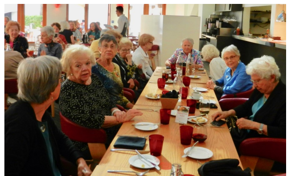
Lunch at Tangata at the Bowers Museum in November