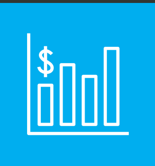
Business and Economics