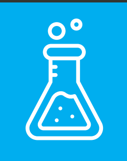
Natural Sciences and Mathematics