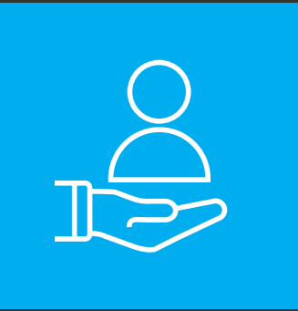
Humanities and Social Sciences