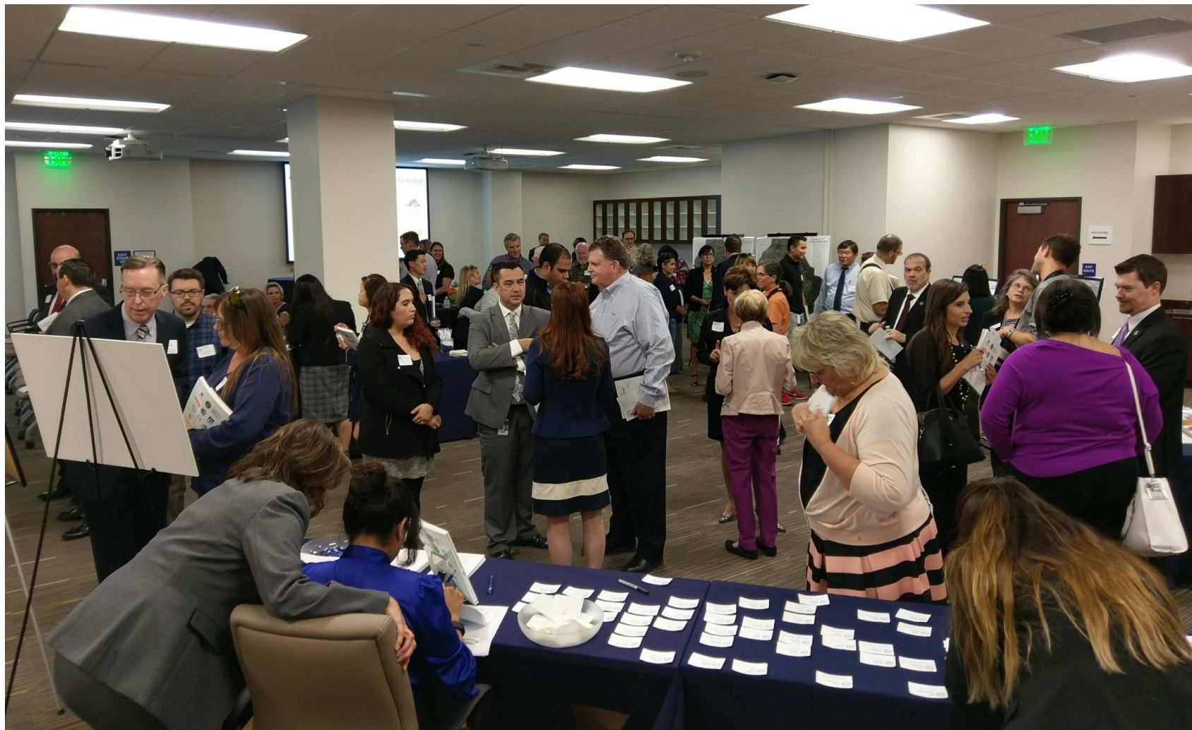
20TH ANNIVERSARY RECEPTION IN CSUF AUXILIARY SERVICES CORPORATION BOARDROOM.