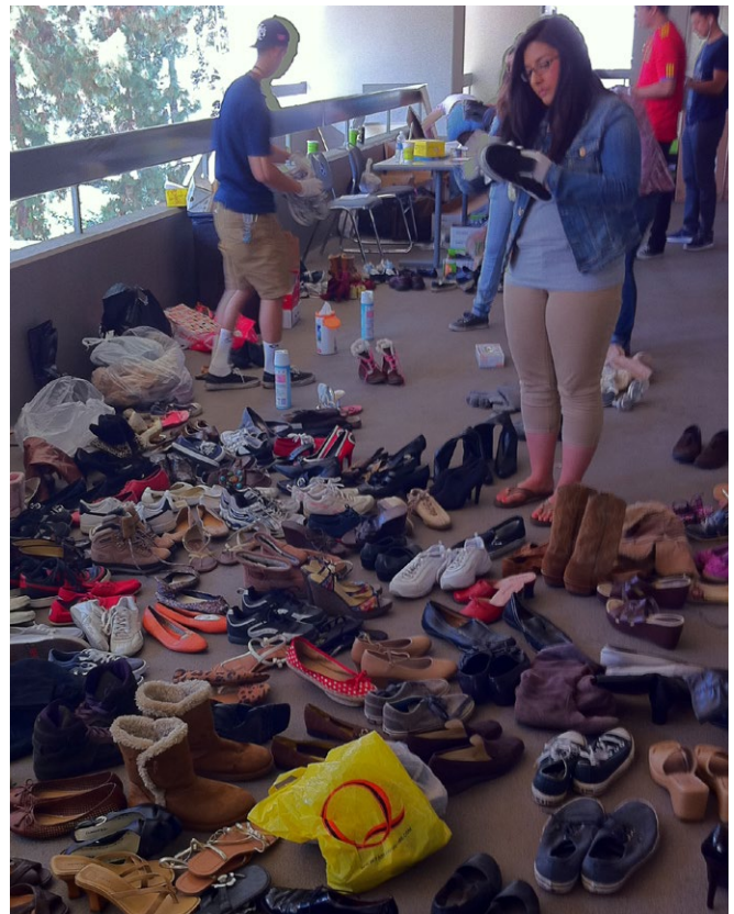
HHD and the Child and Adolescent Studies Student Association led the "Titans Stepping Up" shoe drive which generated more than 1,300 pairs of slightly worn or new shoes for those served by more than 60 shelters, agencies and family resource centers that had signed up to distribute them.