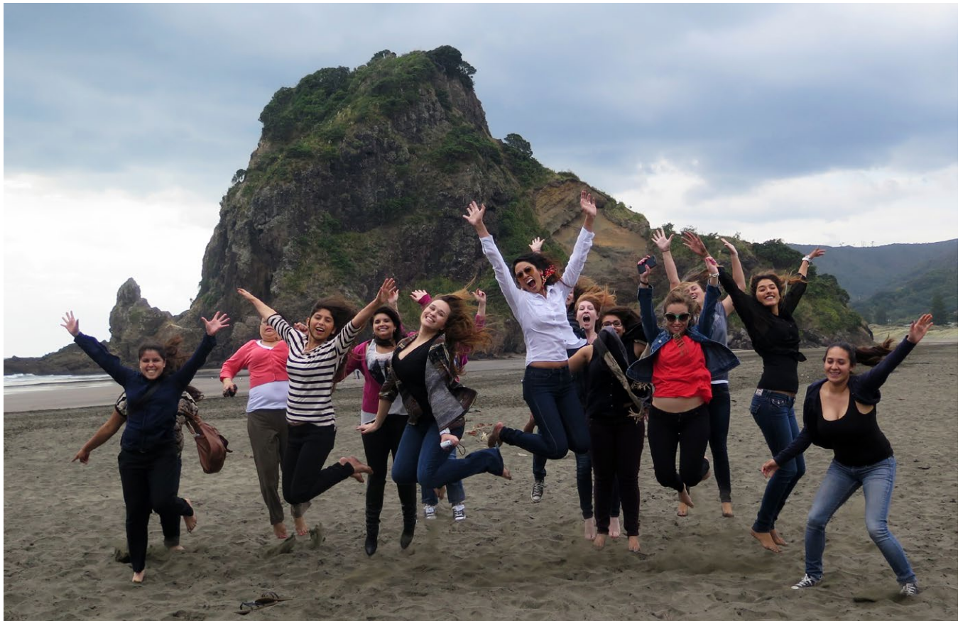
Participants in the spring 2014 cohort traveled to New Zealand for professional development opportunities in Auckland and surrounding communities. Top: Learning about the Māori culture at Whakarewarewa Village in Rotorua, New Zealand. Bottom: Spring break “down under” brings out the kid in CSUF students at Karekare Beach in West Auckland.