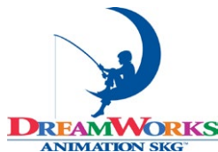
Stellar Support of Students DreamWorks Animation