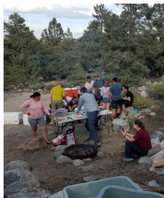
Dinner bell at French Camp in the Sierra Nevada

The students dry camped the entire 3+ weeks in the White Mountains cooking their own meals and enjoying the occasional "bath" in the Owens River.