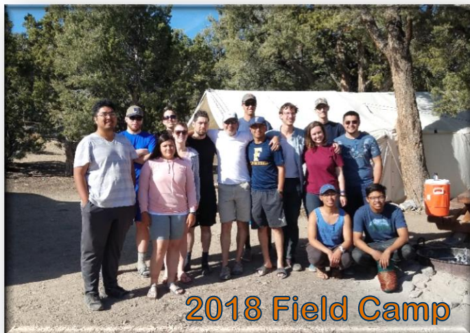
2018 Field Camp