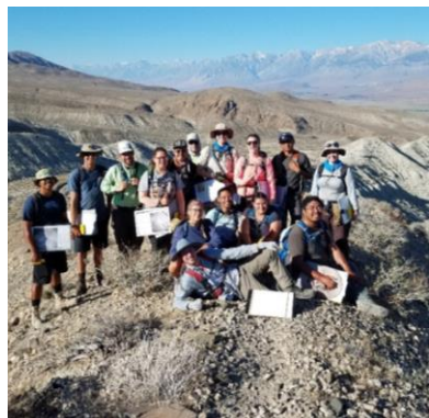
Mapping in the Waucoba Beds at the base of the Inyo Mountains with the Sierra Nevada in the background

For the 2nd half, the students learned Quaternary mapping in the Waucoba Lake Beds near Big Pine. In between, there were excursions to Long Valley caldera, the Bishop Tuff, Mono Lake and the glacial moraines at Convict Lake.