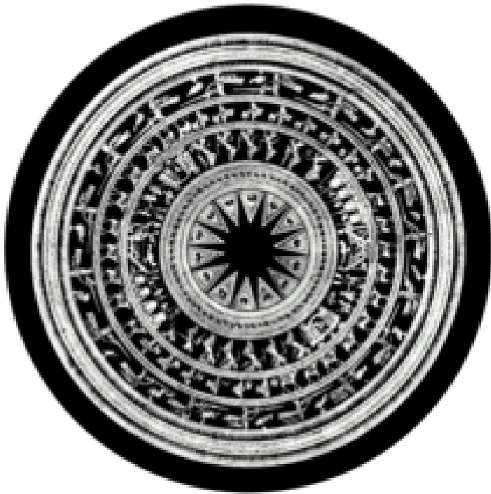
Ngọc Lũ bronze drum's surface, Vietnam