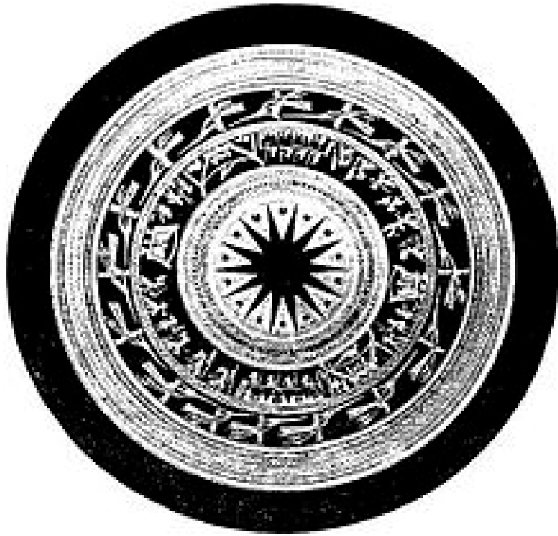
Cổ Loa drum's surface, Vietnam