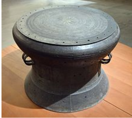
Đông Sơn drum