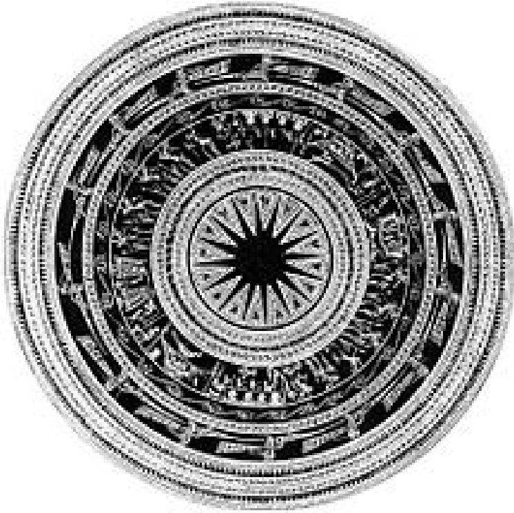
Hoàng Hạ (Hòa Bình) bronze drum's surface, Vietnam