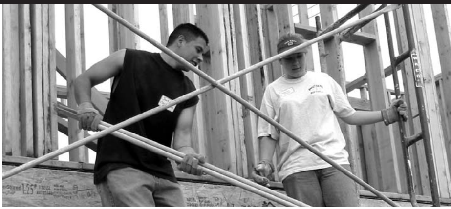
Habitat for Humanity Building Project in Costa Mesa, CA